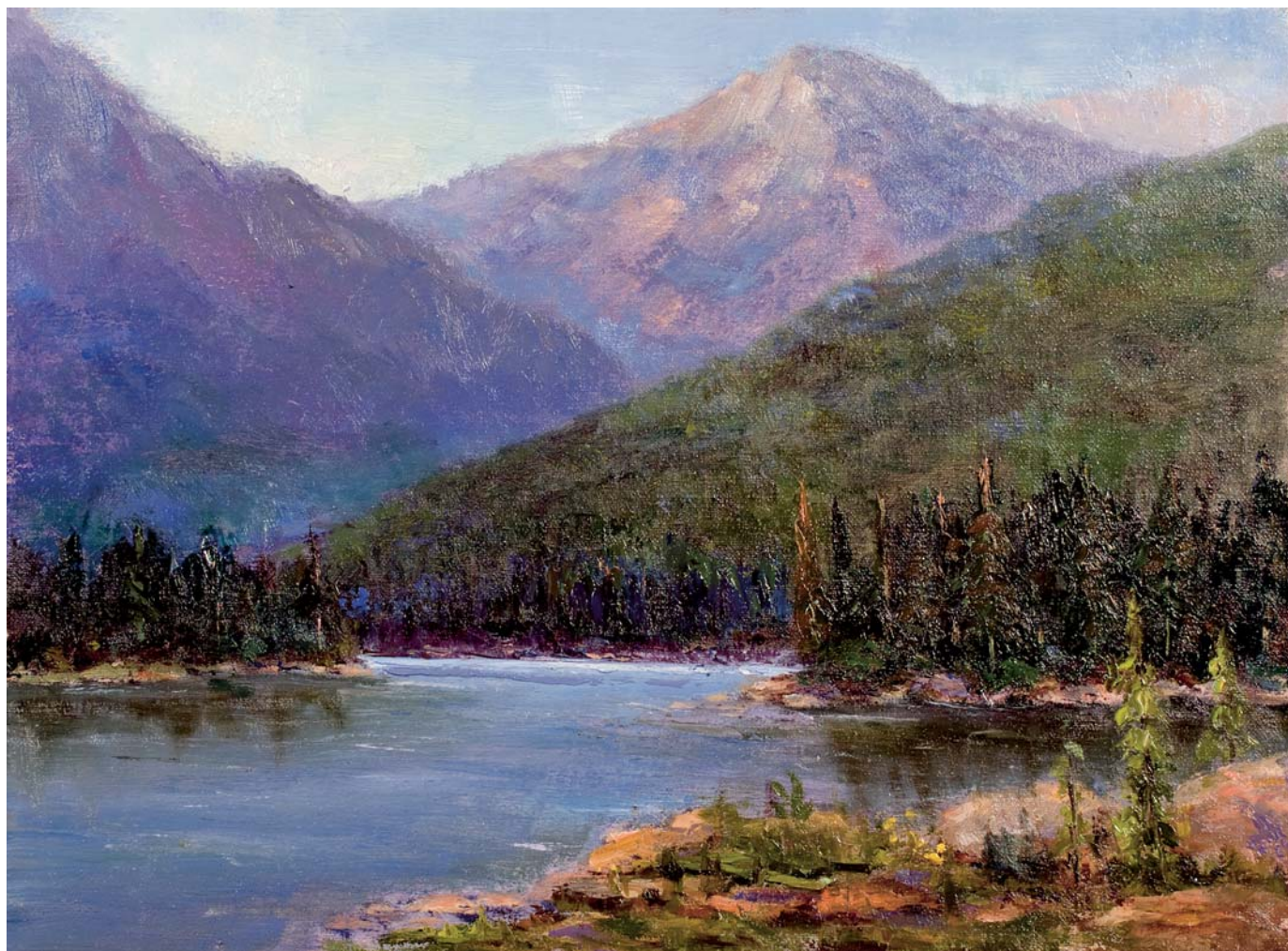
Monument Lake , oil on board, 12 x 16"